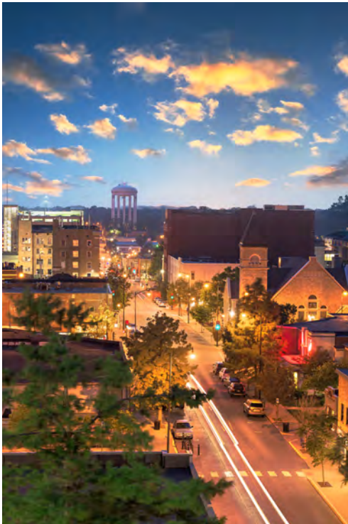
Cover image: Dusk over downtown Columbia, Missouri in Spring

The Missouri Engineer is published quarterly by the Missouri Society of Engineers. Opinions expressed by authors herein are not necessarily those of the Society. As a matter of policy, MSPE does not endorse any item, product or advertisement.