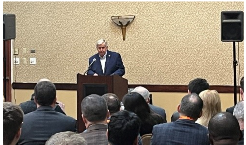
Governor Mike Parson address engineers